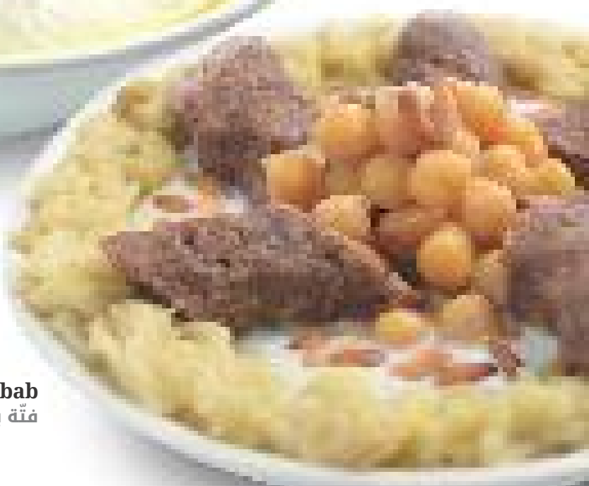
Fattet Eggplant & Kabab فتّة باذنجان و كباب