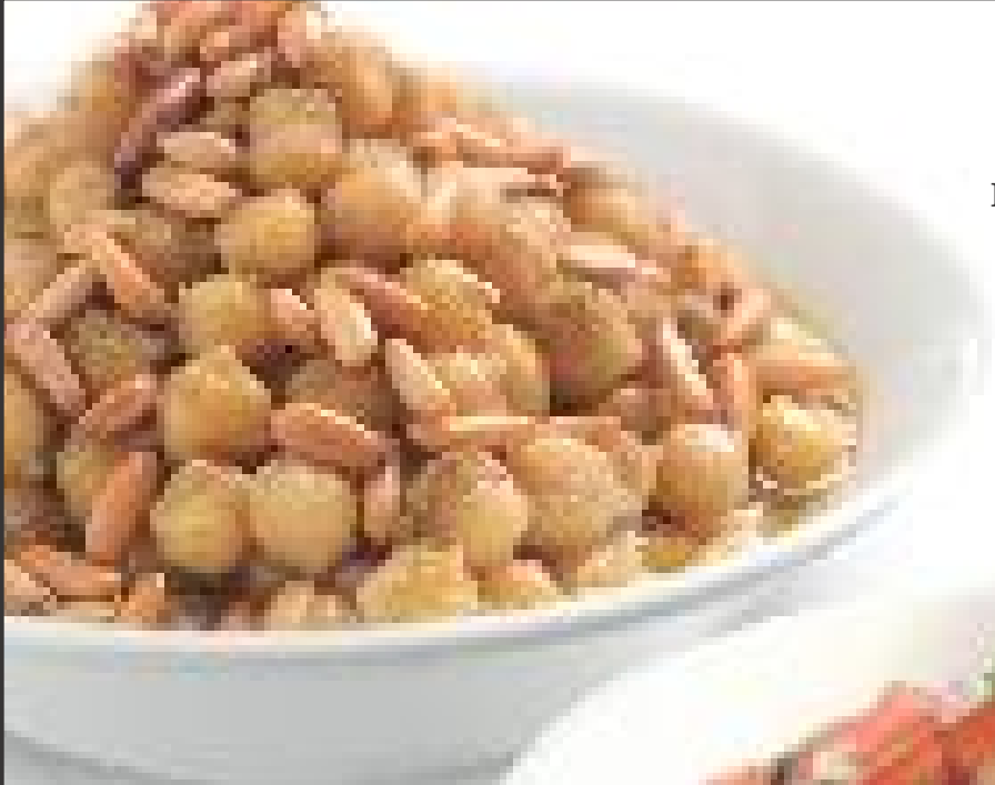
Balila & Pine Nuts بليلة و صنوبر