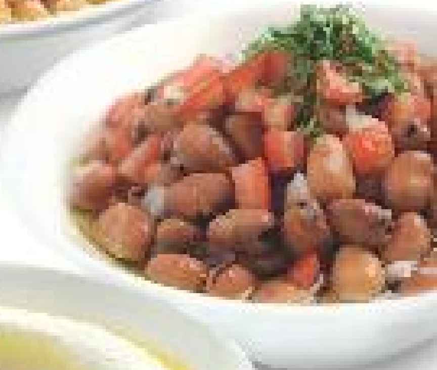
Foul Kababji فول كبابجي