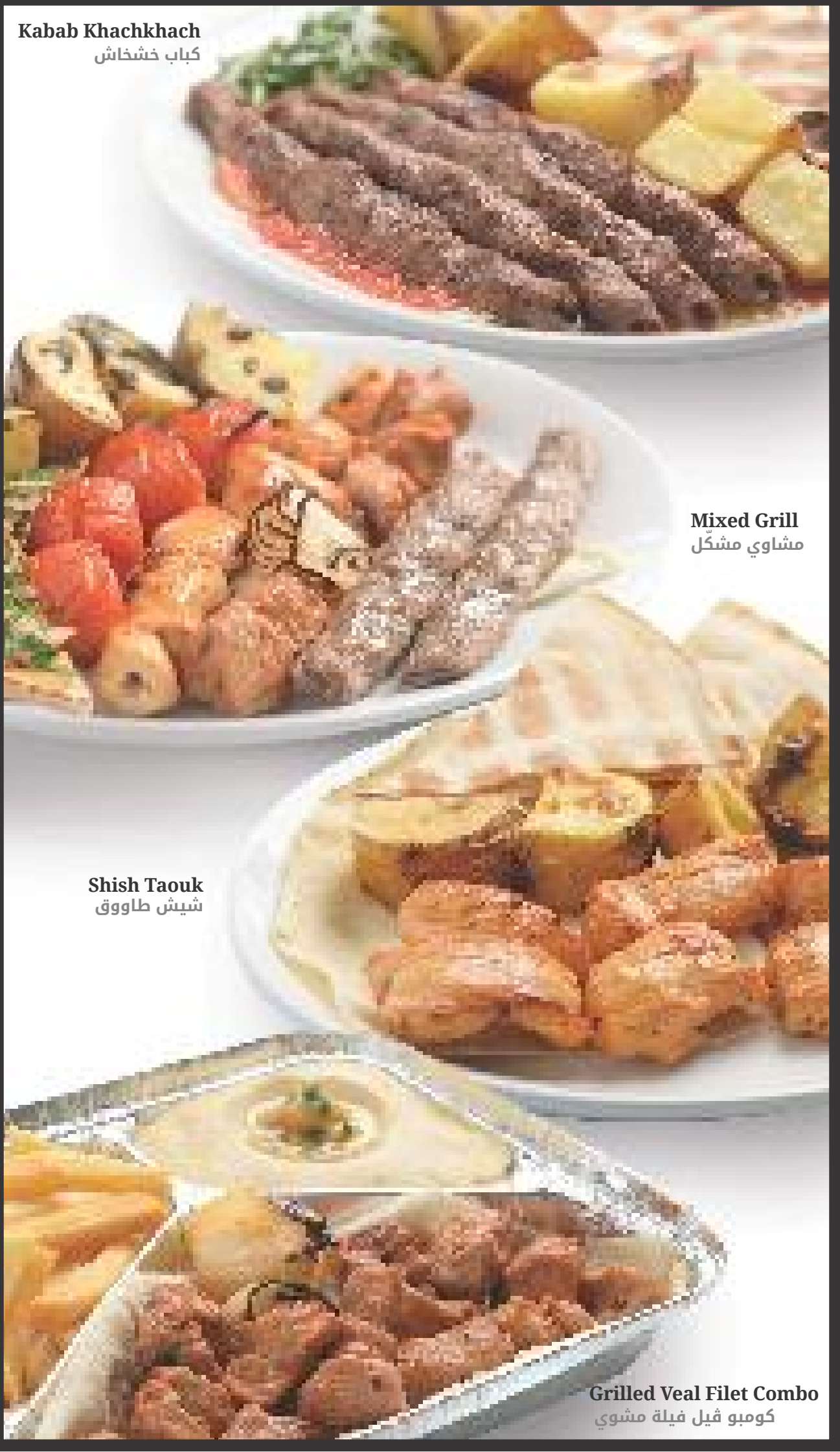
Kabab Khachkhach كباب خشخاش