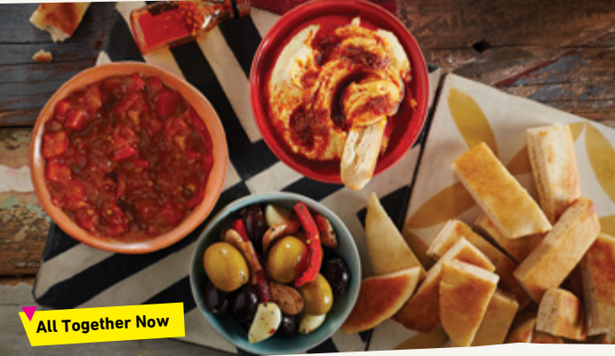
For illustrative purposes only. Product may vary.

Chicken Livers and Portuguese Roll 24 You haven't lived until you've tried these. On your own or for 2 people to share.