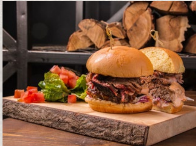
Mighty Beef Burger