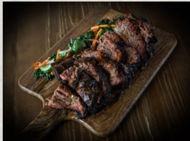
The Mighty Brontosaurus Rib