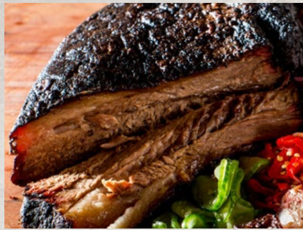
USDA Beef Brisket