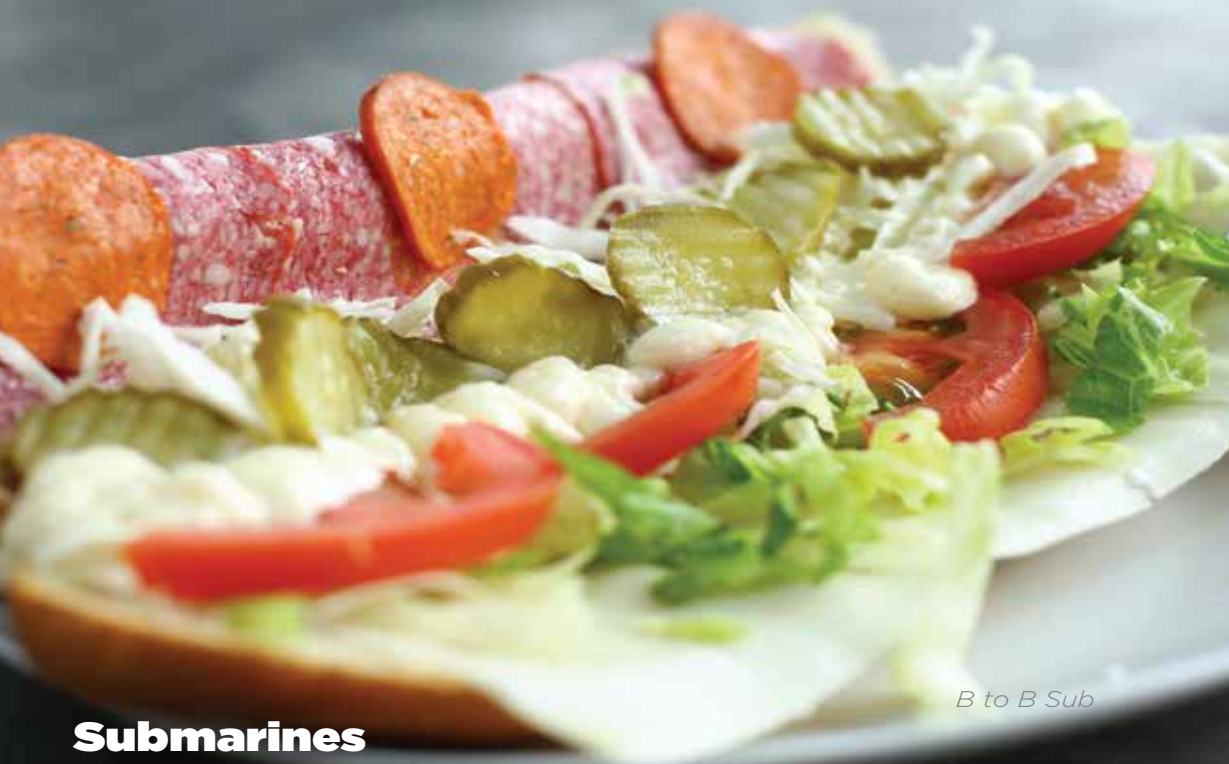
B to B Sub