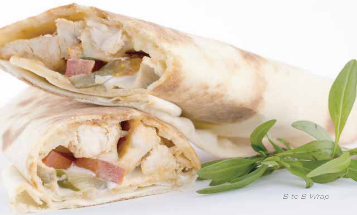
B to B Wrap