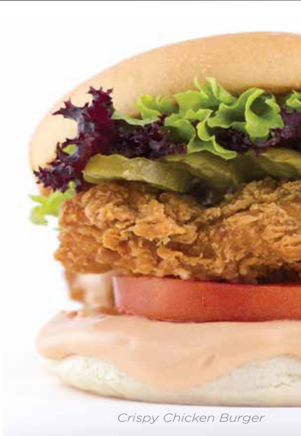
Crispy Chicken Burger

Deep-fried fish burger, pickles & lettuce served with homemade tartar sauce.