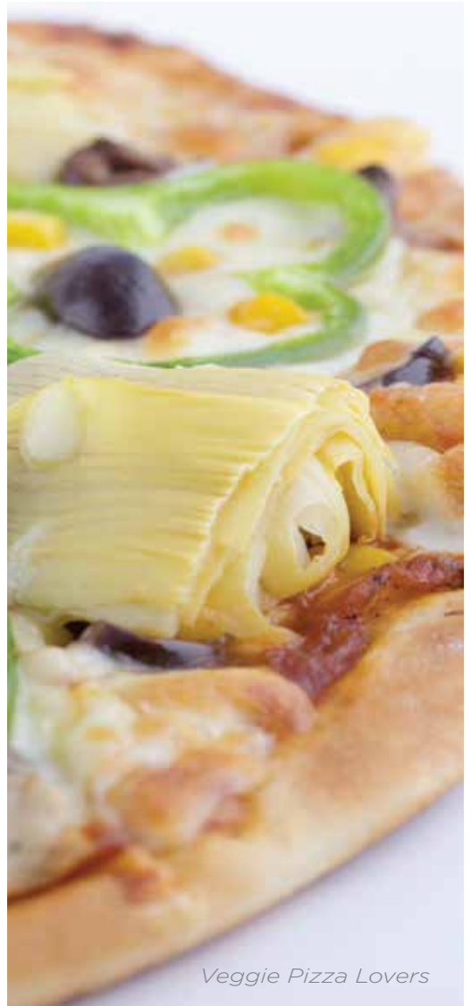
Veggie Pizza Lovers

Béchamel Sauce, diced grilled chicken breast, mozzarella, parmesan, mushroom & rocca.