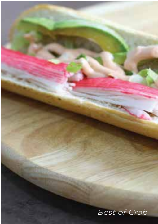
Best of Crab